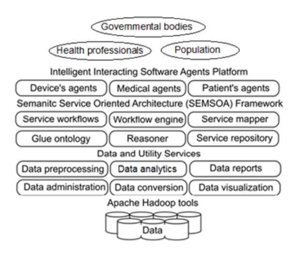
Figure 1. Key points of the proposed architecture

Our proposal is the semantically-enhanced eventdriven service-oriented architectural model (SEDSOA), which can facilitate the development of the intelligent software agents discovering and interacting with heterogeneous devices (Fig.1).